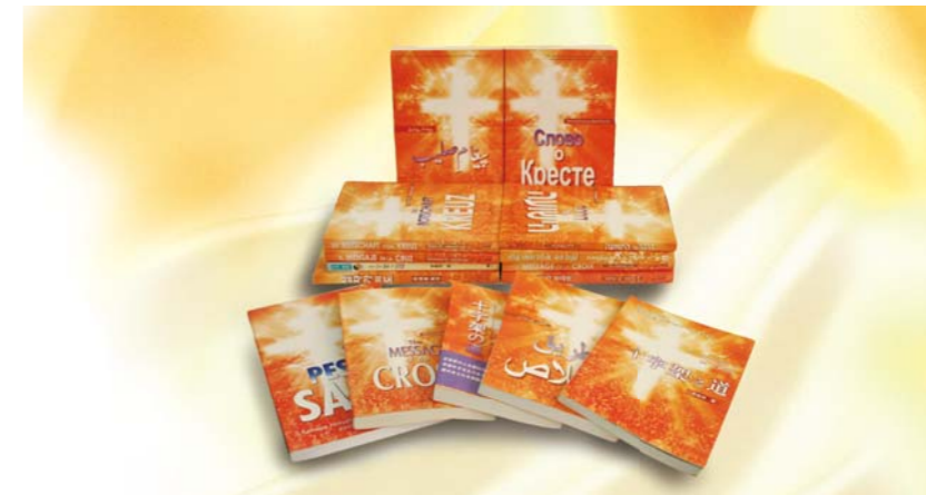
The Message of the Cross published in multiple languages

The law of the redemption of the land is directly related to the law of the spiritual realm on the salvation of mankind. Following his disobedience, Adam had to relinquish all authority he had received from God to the enemy devil but when an individual who is fit to redeem that authority comes along, the enemy devil must return that authority. God had prepared Jesus Christ, qualified according to the law of the redemption of the land, and opened the door to salvation.