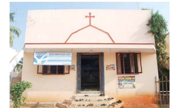
Madurai Manmin Church