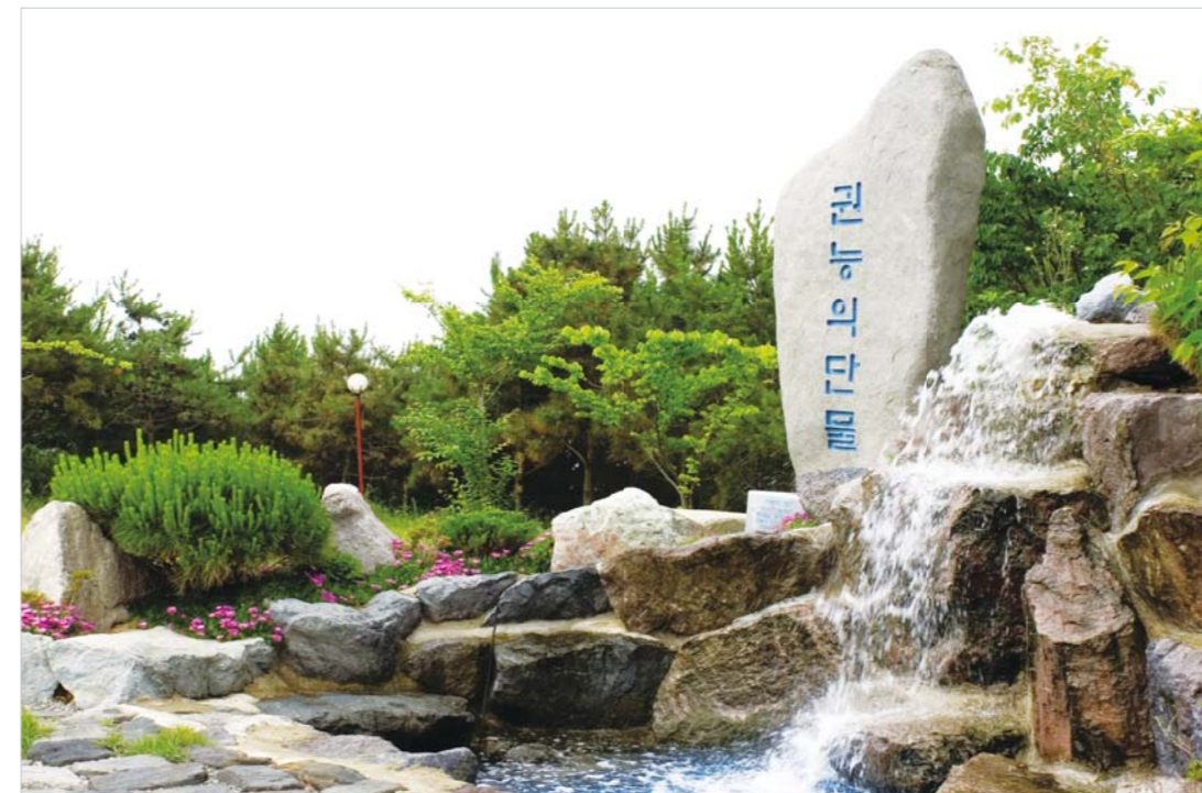
Even today, many Christians are visiting this scene of God’s power where the sea water was turned into sweet water near Muan Manmin Church located at San 153, Chunjang-ri, Haeje-myeon, Muan-gun, Jeonnam Province.

The Salty Water Turned into Sweet Water and the Works of Holy Spirit were Manifested