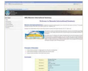
The Manmin International Seminary (MIS) website

The headquarters of MIS is located in Seoul and it has campuses in Belgium, UK, Russia, India, China, Taiwan, US, Peru and so on. The students can also listen to the online lectures. If you log on to MIS website at www.manminseminary.org , register as a member and fill out the form, the