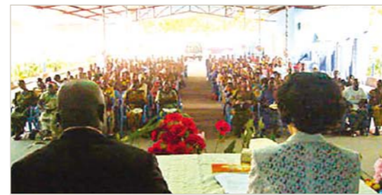
On February 22, at the Women's Seminar held in Kinshasa Manmin Church, DR Congo, the participants are paying attention to the Speaker's message.