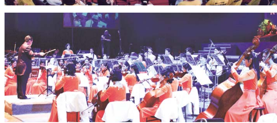
Nissi Orchestra magnifies God with its performances at Christmas Celebrations, "Happy Concerts, Easter Cantata, and a variety of Christian events in Korea and at overseas crusades