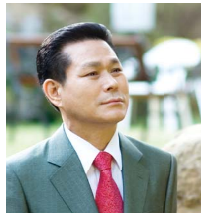
Senior Pastor Dr. Jaerock Lee

James 4:11 says, "Do not speak against one another, brethren. He who speaks against a brother or judges his brother,