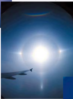
[ Outside of the airplane on February 21, 2006, when the mission team went to the DR Congo United Crusade ]