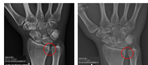
Before prayer: Calcification After prayer: No calcification