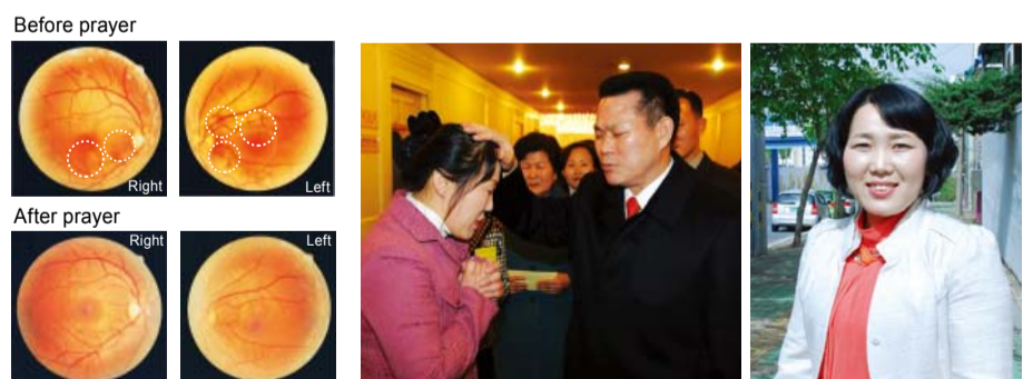
The retinograph shows that cyst in both eyes disappeared. Her eyesight also recovered from 0.8/0.25 to 1.0/1.0.

Then, everything that had looked rough and yellow came to look normal. She had a retest that showed that everything had become normal. Her eyesight was 0.8/0.25 before the prayer but it improved to 1.0/1.0 after the prayer. Afterwards, her eyesight even got better to 1.2/1.2. Normally, it takes around six months for Harada disease to be completely healed in the hospital, but she was healed of it just in two weeks and she was saved from the danger of blindness. It is astounding.