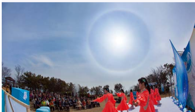
[ Over Muan Sweet Water Site, on March 6 in 2014 ]