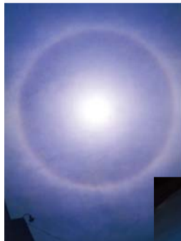
[ Over Manmin Central Church on May 15, 1998 ]

"And He who was sitting was like a jasper stone and a sardius in appearance; and there was a rainbow around the throne, like an emerald in appearance" (Revelation 4:3).