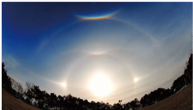
[ Over Muan Sweet Water Site, on January 27 in 2011 ]