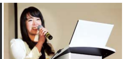
She was testifying to her healing case in the 10 th WCDN International Christian Medical Conference in Mexico