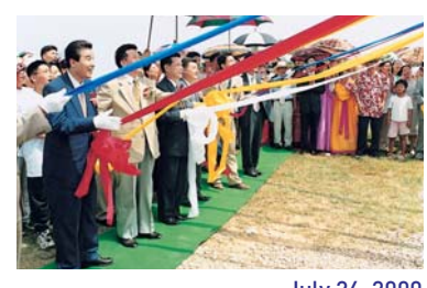
July 26, 2000 Monument Unveiling Ceremony

went up to the hill where the ground water well was. We offered up praises and thanksgiving prayer. Then, we went close to the well.