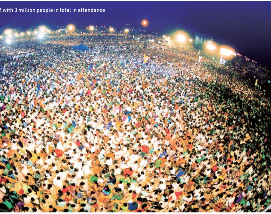
2 with 3 million people in total in attendance