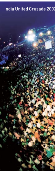
India United Crusade 2002

Life, death, fortune, and misfortune are in the control of God. Thus, if one revives another from the dead, it is definitely a work of God. Elijah brought the son of a woman in Zarephath back to life (1 Kings 17:17-24). Elisha revived the son of Shunammite woman (2 Kings 4:32-37). When Apostle Peter said, “Tabitha, arise,” although she