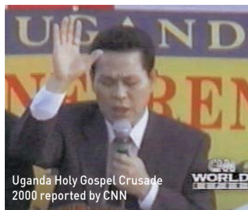
Uganda Holy Gospel Crusade 2000 reported by CNN

“Once God has spoken; twice I have heard this: that power belongs to God” (Psalm 62:11).