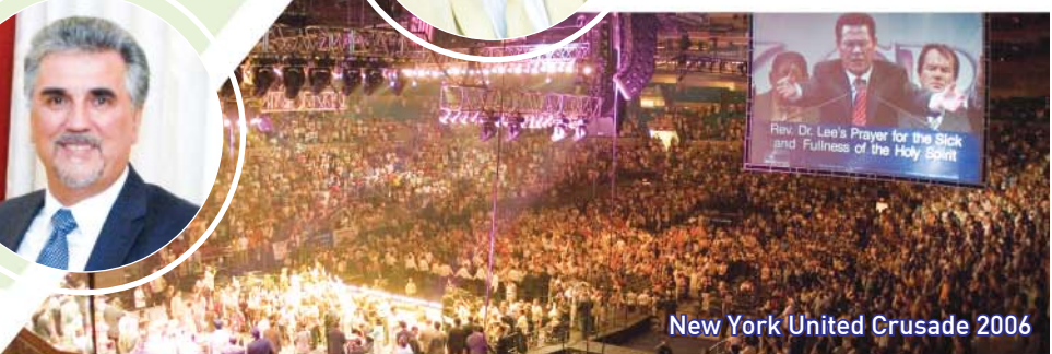
New York United Crusade 2006