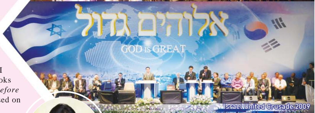
Israel United Crusade 2009