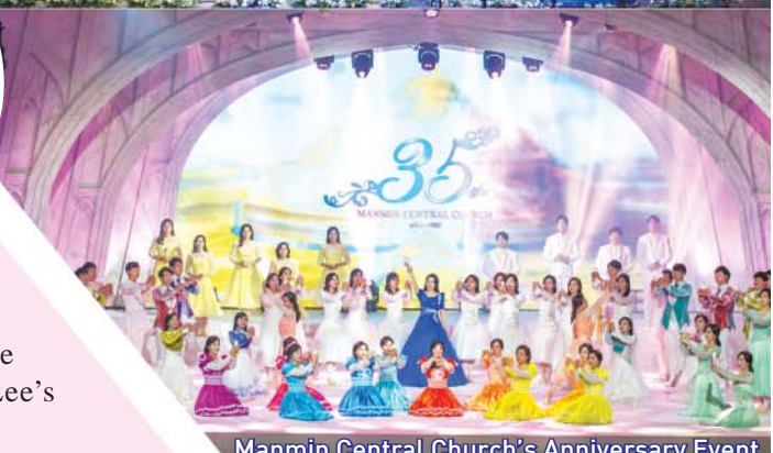
Manmin Central Church's Anniversary Event