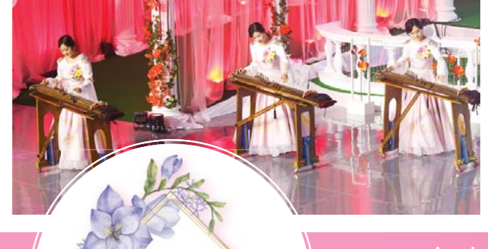
Anniversary Performance "'Flowery Road' Banquet Hall"