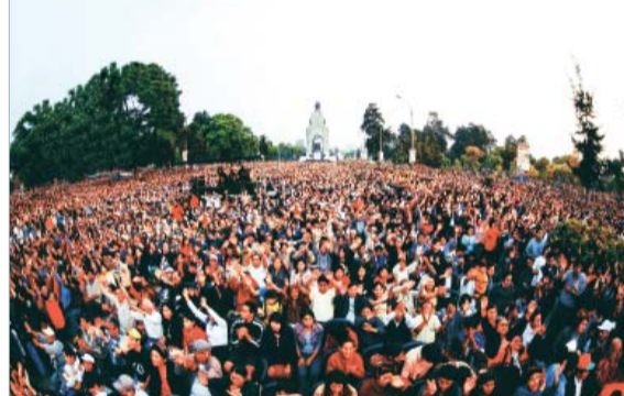
2006 D.R. Congo United Crusade