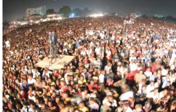
2006 New York United Crusade in the United States