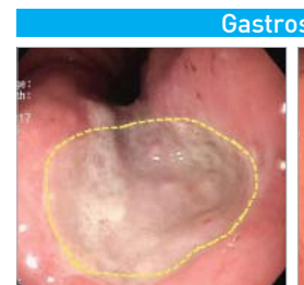
Before Prayer: Huge ulcer in gastric angle

I give all thanks and glory to the Lord and God the Father. I give thanks to Senior Pastor for always praying for me.