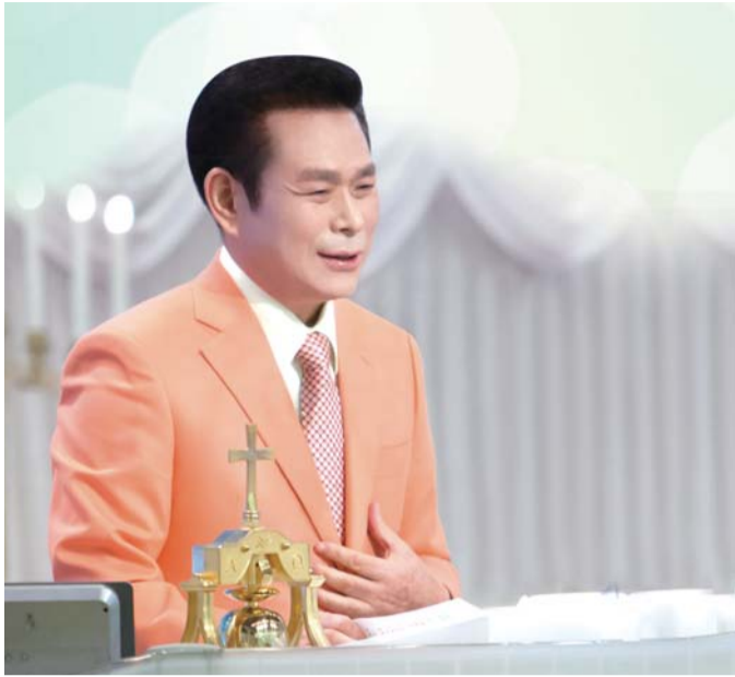
Senior Pastor Rev. Jaerock Lee