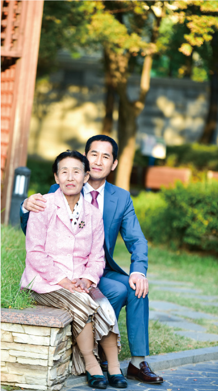
Abdominal CT scan (Deaconess Lee, Soo-Kum)