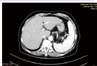
After Prayer: hydrops abdominis not seen