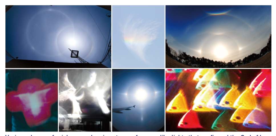
Various shapes of rainbows and various types of aurora-like lights that confirmed the God of love being with us and added hope and faith in heaven.

Our church had great trials and crises that seemed impossible to overcome. But God was always with us even during the trials. After such time passed, we could see why He allowed for us such time through the fruit of blessings. As explained, our Father God has guided us with so much endurance and love to establish this church and our denomination, to let us accomplish world evangelism, and to let the faith of church members grow up.