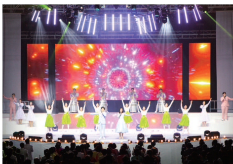
Scene 7. Joy of Anniversary Congregational praise offered by all the members to God