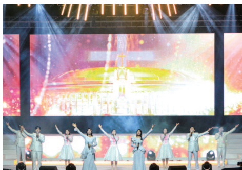
Scene 3. Praise of Victory Thanksgiving praise to God who's been with Manmin ministry