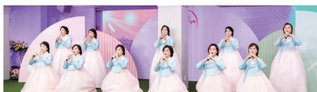
▲ Gold prize / Serem Choir (Women's mission)