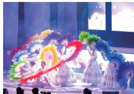
Scene 4. Dance of Victory Fan dance of thanksgiving for the true peace given for 40 years