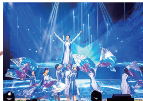
Scene 6. Work of Power Worship dance offered to God who's been glorified through His great power