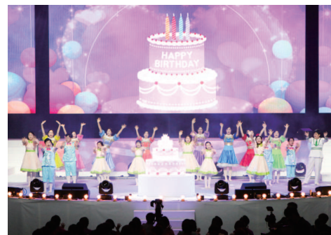
Scene 2. Anniversary Celebration Performance celebrating the 40 th anniversary with one mind