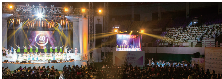
Finale / All the performers gave thanks and glory to the Triune God who has kept and protected our church until the 40 th anniversary