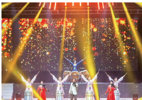
Scene 5. Instrumental play of Victory Drum and electronic string performance with thanks for the fiery work of the Holy Spirit