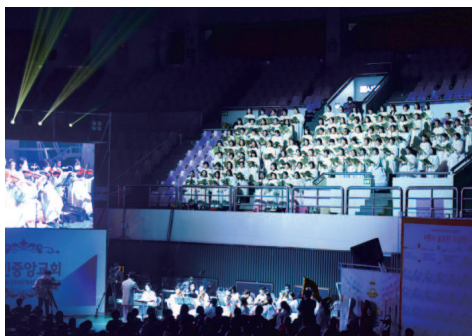
Scene 1. Opening Choir song of inspiration to God in celebration of the 40 th anniversary